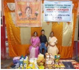
Members present - 16 + guests 25